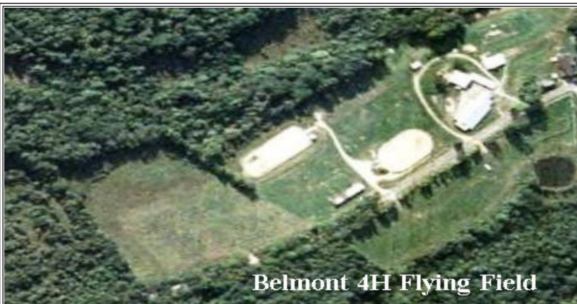
Belmont 4H Flying Field